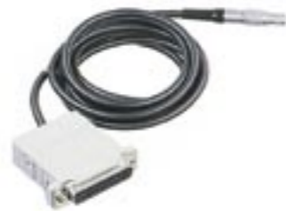
Serial data cable for printer and PC