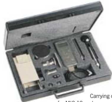
Carrying case for MIC 10 and accessories