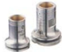
Flat probe shoe attachment MIC 270 Prism shoe attachment MIC 271