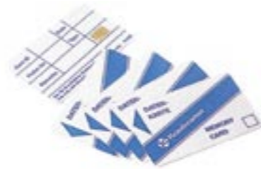
Memory cards for the storage of measurement and calibration data as well as report formats