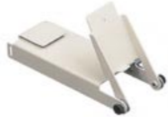
Instrument carrier and prop-up stand MIC 1040