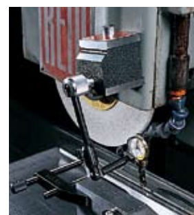
Top: 657A with 196B1 Universal Dial Indicator setting up workpiece on milling machine Above: 657A with 711LS Last Word Dial Test Indicator setting up workpiece on surface grinder