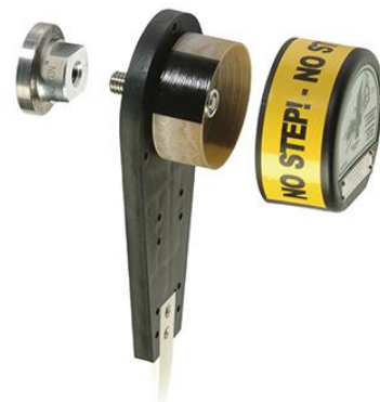
Whirligig® with Optional Mag-Con™ Connector