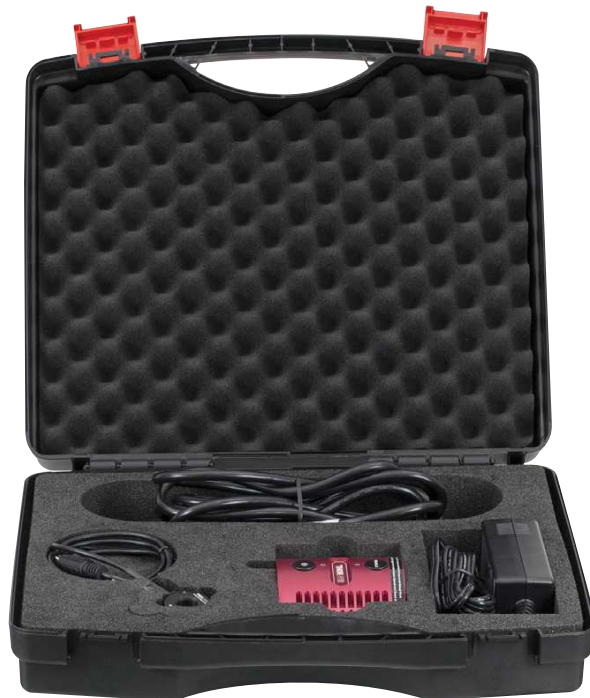
Figure 1 Image of Product Parts in Case

The SHB05(T) come with the shutter head, controller, external switching supply, AC cord, and this manual.