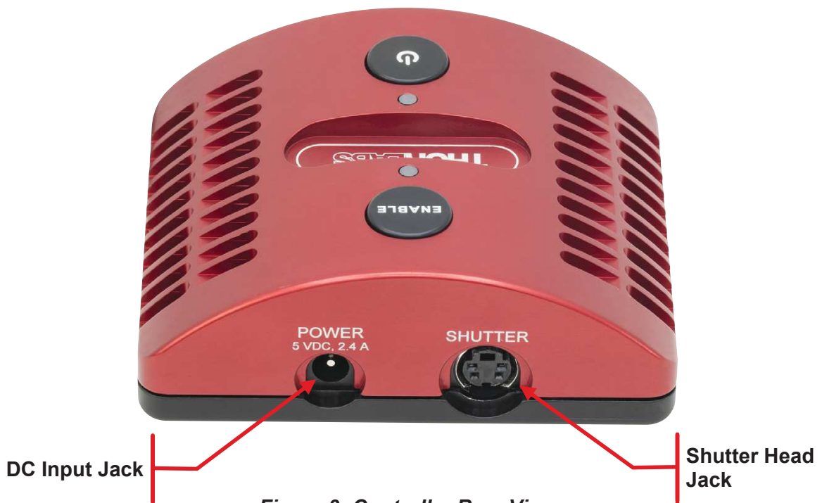
Figure 3 Controller Rear View