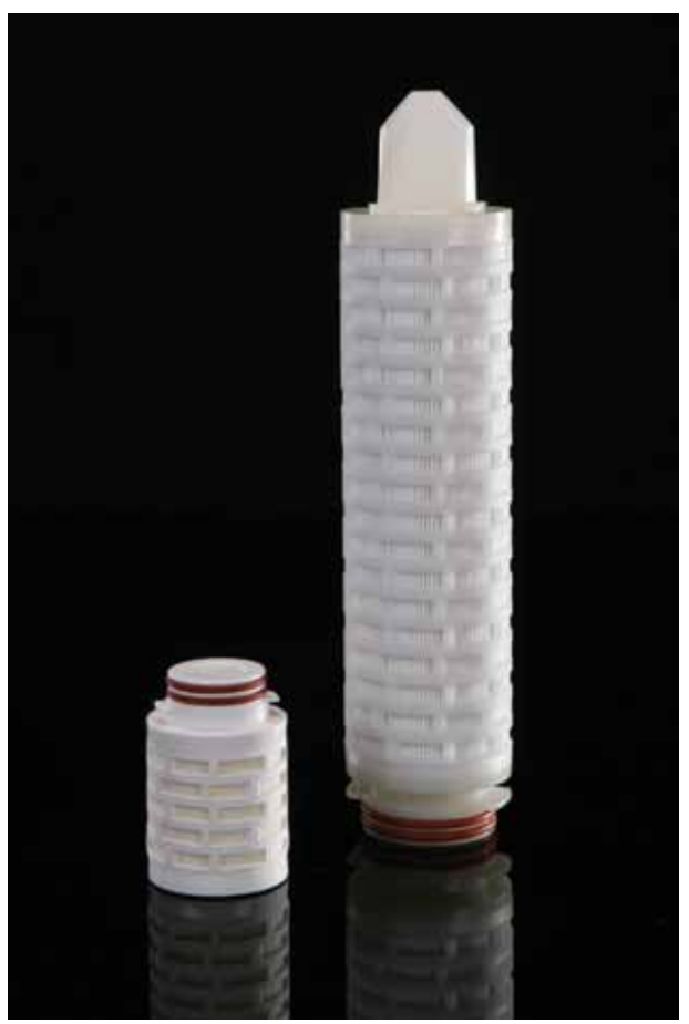
Note: BIO-X is a registered trademark of Parker domnick hunter